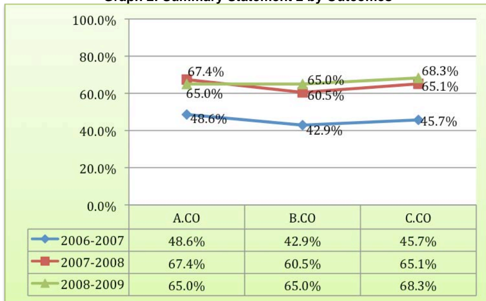
Graph 2: Summary Statement 2 by Outcomes

Awareness sessions on the early childhood outcomes was provided to parents, early childhood and special education teachers in the FSM States during the annual summer teacher training institutes that was held in Kosrae in Summer 2009 or during the Teacher's Convention held in Pohnpei State in June 2009. However, based on input from a stakeholder session held in January 2010, it is recommended that additional training activities in the outcome areas be provided to parents and teachers to increase their knowledge and skills in social emotional development of young children, early literacy, early language, and communication; and the use of appropriate skills to meet their needs including the use of assistive devices. Furthermore, provide additional training on using the COSF process to ensure continuity and consistency of the process across the four FSM States.